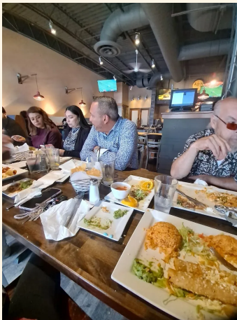
Chips and Salsa